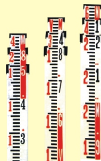
Aluminum Levelling Staff