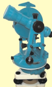
Direct Reading Theodolite