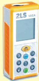
Laser Distance Meter