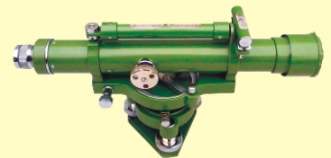
Quick Set Dumpy Level