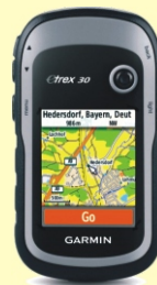
Global Positioning System