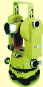
Micro Optic Theodolite